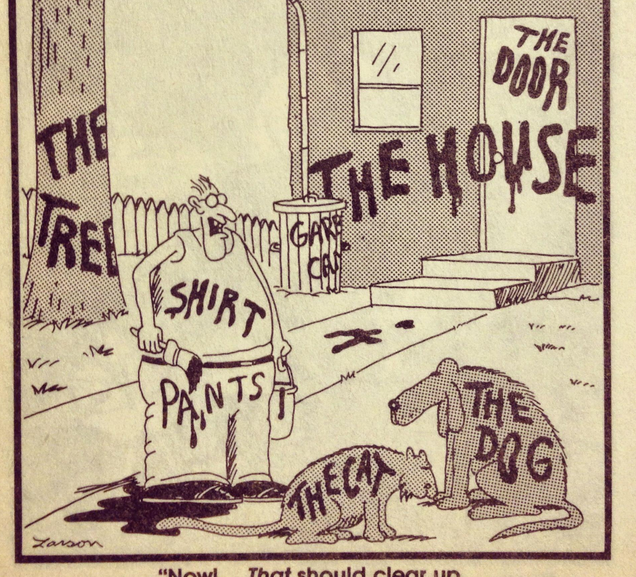
"Now! ... That should clear up a few things around here!"